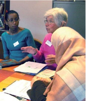
The NFPB at a workshop at a conference in Bolton, 2007 on "Tackling Racism, Building Peace".

I'm one of those people lucky enough to live in the part of Britain served by the Northern Friends Peace Board (NFPB). Set up just before the outbreak of war, in 1913, its aim since then has been "to advise and encourage Friends, and through them their fellow citizens, in the active promotion of peace in all its height and breadth". Always careful to discern how best to address the needs of the time, NFPB is currently working to build peace and tackle racism in local communities and challenge militarism.