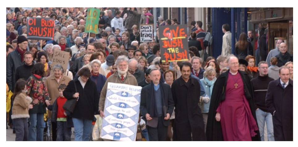
2003 anti-war march in Winchester

The projects in the West Midlands and Newcastle are just two examples of local Quaker peace work, and there are many more. But Quakers don't