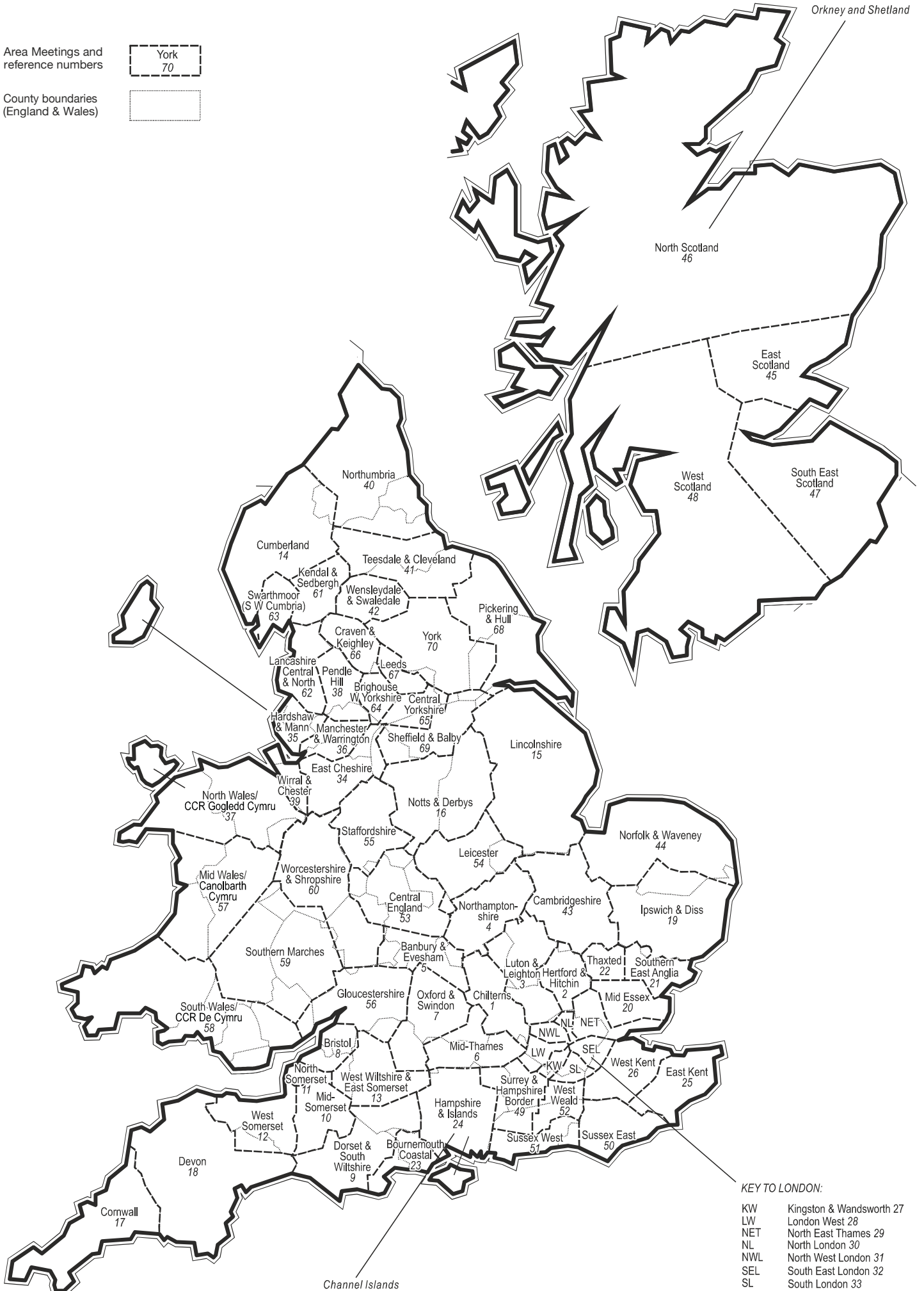
Figure 2. Area Meetings of Britain Yearly Meeting