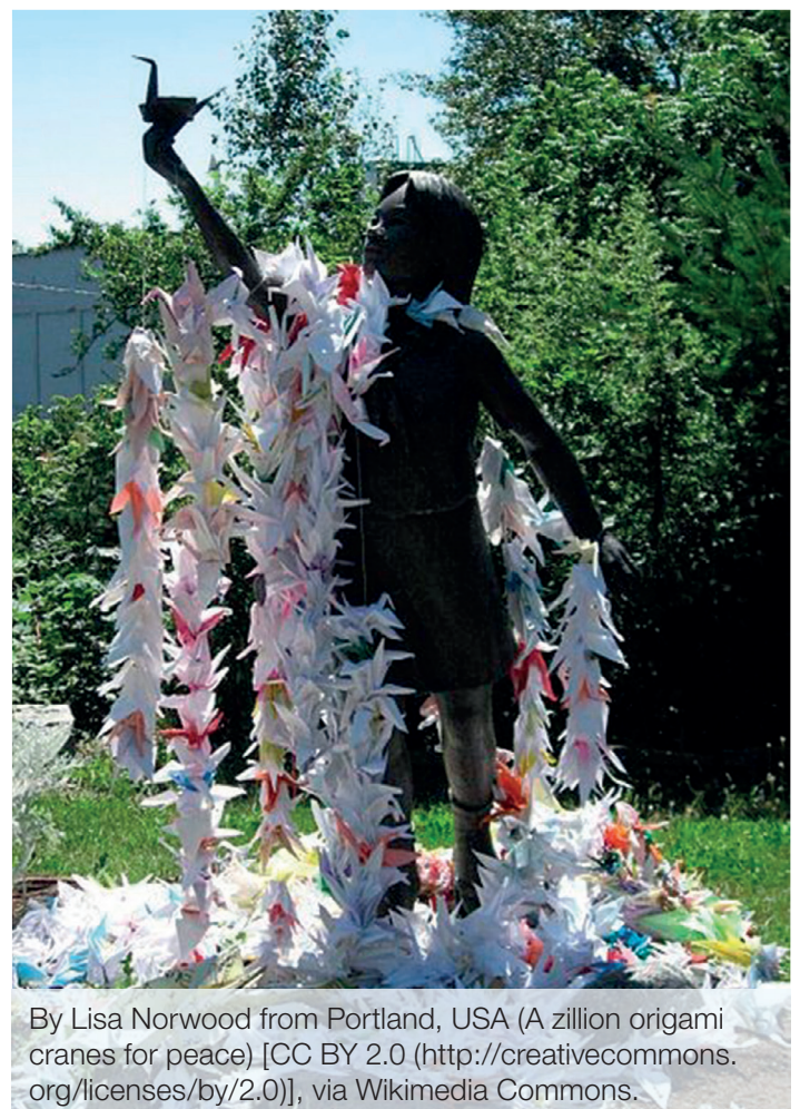
By Lisa Norwood from Portland, USA (A zillion origami cranes for peace) [CC BY 2.0 ( http://creativecommons.org/licenses/by/2.0 )], via Wikimedia Commons.

This is a memorial statue of Sadako Sasaki. Sadako was a girl who died at the age of 12 from radiation caused by the atomic bomb that was