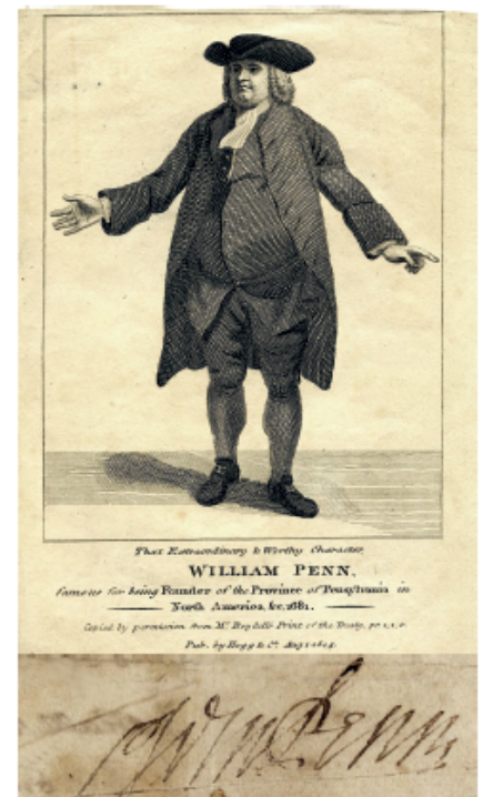
William Penn's signature taken from his manuscripts, circa 1699.

William Penn died in 1718 and was buried at Jordans Meeting House in Buckinghamshire.