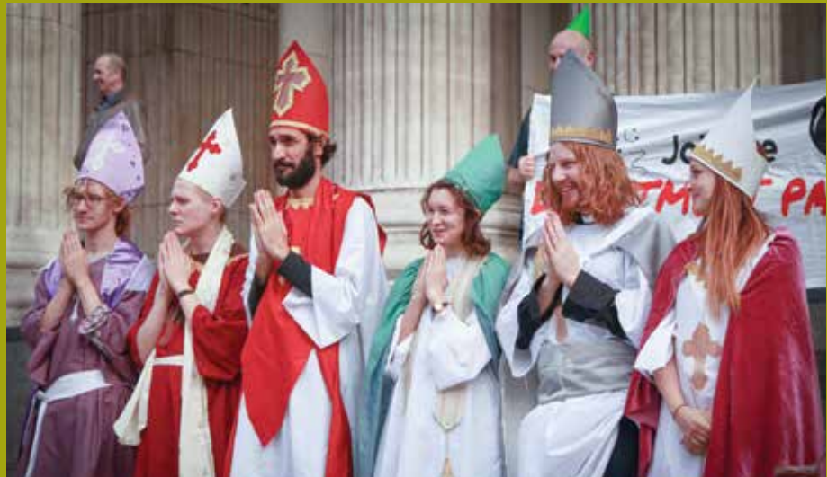
Activists throw a 'divestment party' on the steps of St Paul's Cathedral.

£79.7 million invested in Royal Dutch Shell and BP alone in 2014, the Church has come under pressure to disinvest from oil and gas, but has stated that it will continue to pursue an engagement strategy to convince such companies of the need for change.