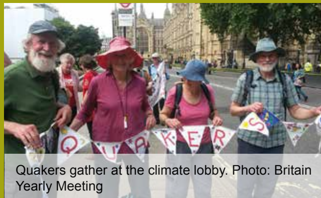
Quakers gather at the climate lobby.