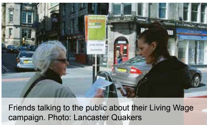
Friends talking to the public about their Living Wage campaign.

Since the July 2015 budget statement more people in the country have been aware that there is something called the Living Wage. George Osborne's 'national living wage' falls far short of what the Living Wage Foundation calculates to be a wage sufficient for people to make ends meet. The Living Wage Foundation's calculations are the product of research carried out annually by Loughborough University's Centre for Research in Social Policy, funded by the Joseph Rowntree Foundation. The research looks at what households need for a minimum acceptable standard of living. Decisions about what to include are made by groups, including members of the public. It is therefore rooted in social consensus about what people need to make ends meet.