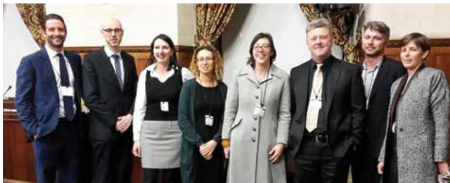
QPSW and Rathbone Greenbank work with others to convince Parliamentarians of the need for strong legislation to ensure that large companies work to prevent slavery occurring in their supply chain.

We are also able to work with other groups such as the Church Investors Group (which other Quaker investor bodies could consider