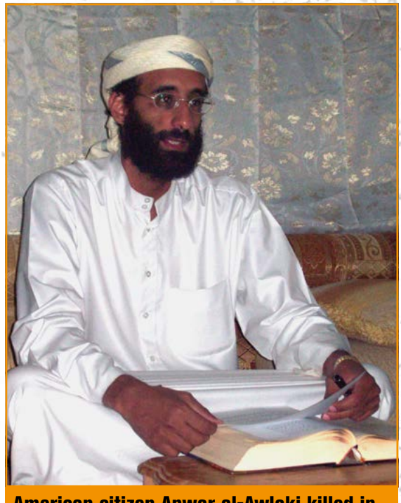
American citizen Anwar al-Awlaki killed in US targeted drone strike in 2011 in Yemen. His 16-year old son Abdulrahman, was also killed in a drone strike two weeks later. Wikipedia

Another fundamental issue is how the advent of armed drones has enabled a huge expansion of 'targeted killing'. All three nations that have used armed drones beyond their own territory – the US, Israel and the UK – have used drones to carry out these pre-meditated extra-judicial killings away from the battlefield.