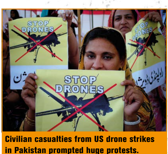
in Pakistan prompted huge protests.

Drone technology is seducing us into believing that we can see, know and understand what is happening on the ground from thousands of miles away; that we can discriminate perfectly