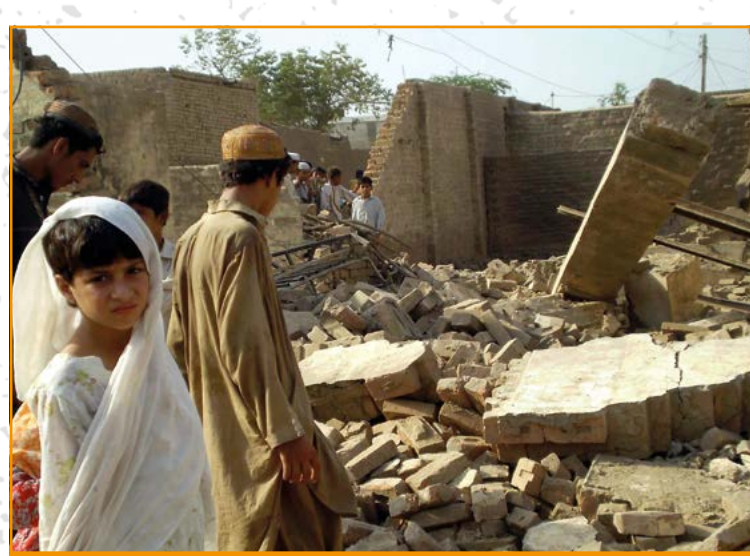
Drone strikes and on-going armed conflict continue to destroy local communities in Pakistan.

There is evidence however of civilians and rescuers being killed in so-called 'double-tap' strikes. This is when drones undertake a second strike some time after the initial one, often killing those who have rushed to help the initial victims.<sup>11</sup>