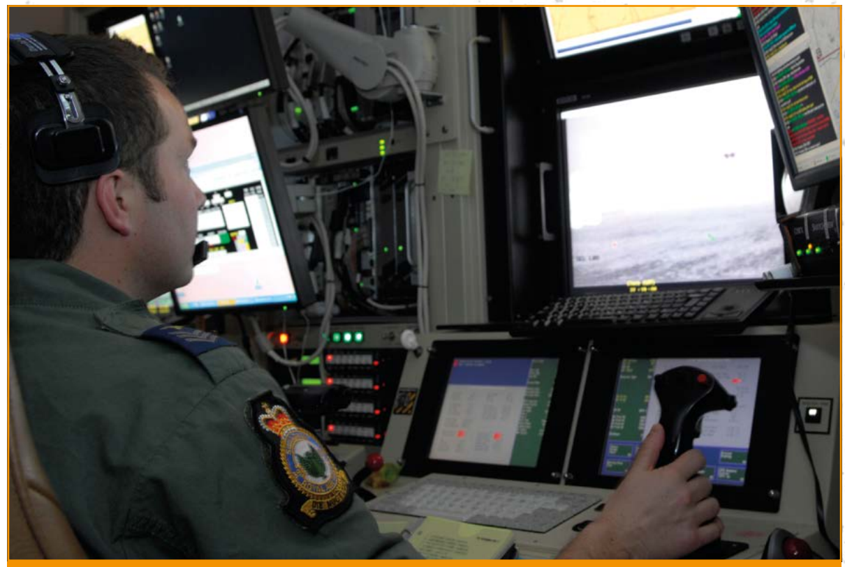
RAF pilot controlling a Reaper drone from Creech air force base in Nevada.

Far from being gung-ho warriors, drone supporters argue, to drone crew suffer post-traumatic stress disorder (PTSD) as they