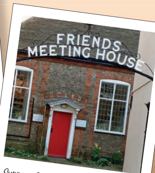
Support for meetings