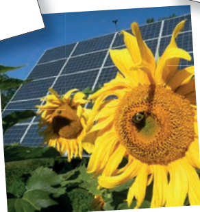
Campaigning for a more sustainable future