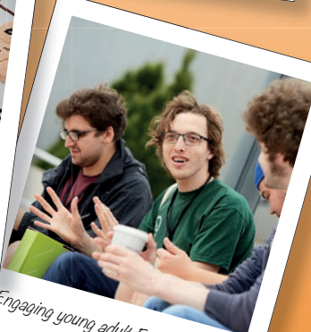
Engaging young adult Friends