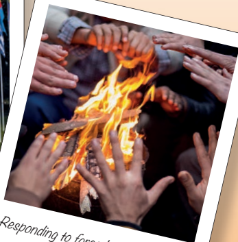
Responding to forced migration