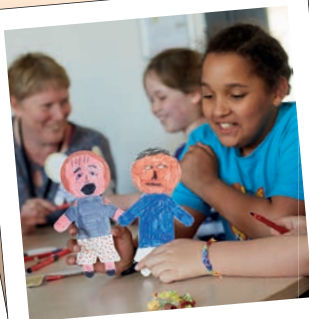
Working with children and young people