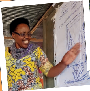
Supporting peacebuilders in East Africa