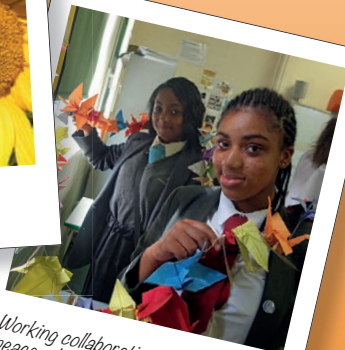
Working collaboratively on peace education