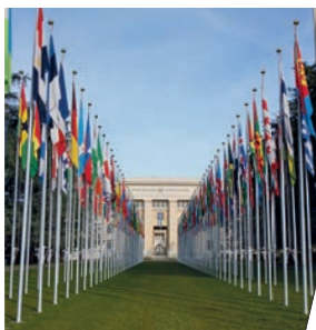
Addressing climate change at the United Nations