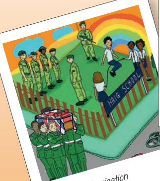
Opposing militarisation and the arms trade