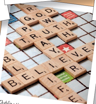
Publications and resources