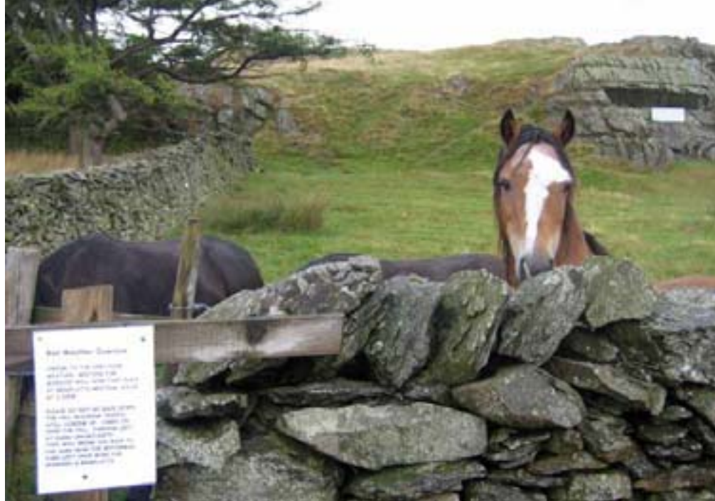
Horses for courses...poor weather meant that filming was moved from Firbank Fell to Brigflatts meeting house