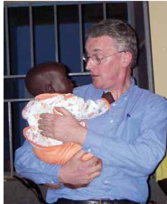
Hilary Benn, Secretary of State for International Development, visited QPSW's partners Empowering Hands. He admitted in his journal: 'As children, they saw things that no child should ever see or experience.'

EH speaking directly to the Secretary of State was a good step. But it is only when they and the hundreds of thousands like them feel the tangible effects of the support pledged by