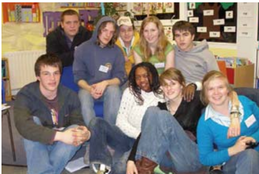
Participants at Junior Yearly Meeting 2006 in their base group

There was much soul-searching on the theme for JYM 07. Eventually this