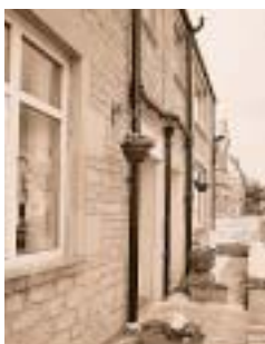
CHYP'S newly refurbished Next Step House for seven young homeless people.

CHYP faces increasing challenges as even younger people come to them needing "a lot of support". QHT and Friends' support will continue to make the difference.