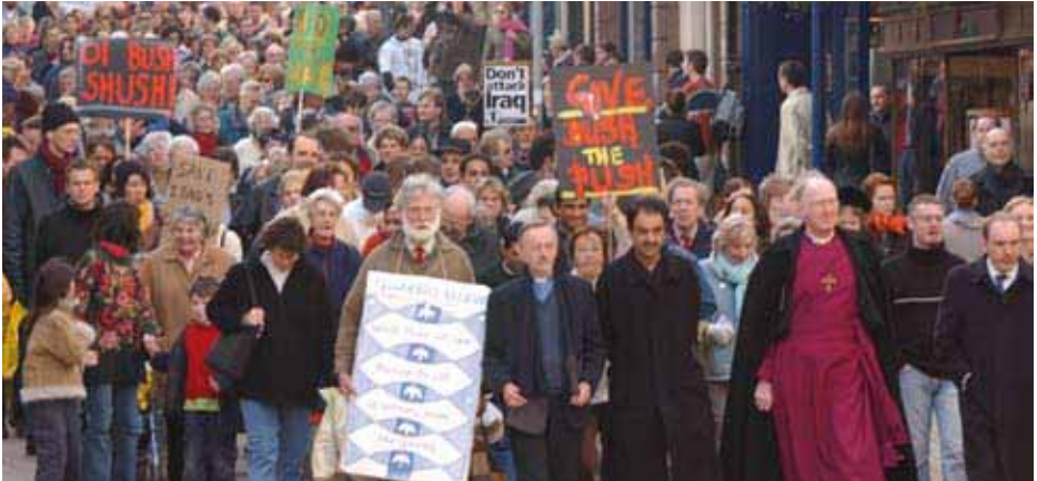
Above: 2003 anti-war march in Winchester

aspects of community life – including education, youth work, planning and architecture.