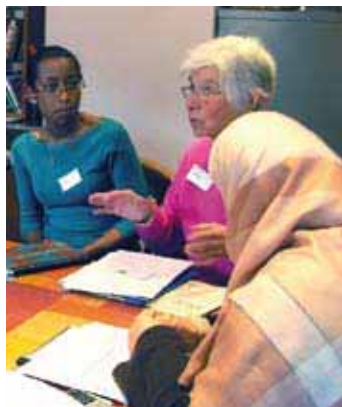
The NFPB at a workshop at a conference in Bolton, 2007 on “Tackling Racism, Building Peace”

I’m one of those people lucky enough to live in the part of Britain served by the Northern Friends Peace Board (NFPB). Set up just before the outbreak of war, in 1913, its aim since then has been “to advise and encourage Friends, and through them their fellow citizens, in the active promotion of peace in all its height and breadth.” Always careful to discern how best to address the needs of the time, NFPB is currently working to build peace and tackle racism in local communities and challenge militarism.