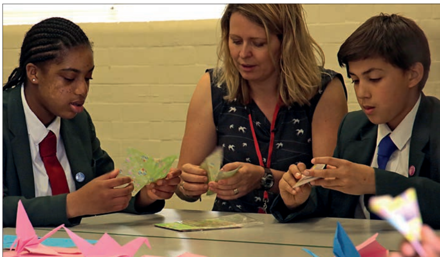
Young people learn about peace and human rights in a London school.

As Quakers we strive to live out our values in our everyday lives, and this has led us to do some amazing things – as individuals, and as local or area meetings. But some things are best tackled at a national level, and this is where Britain Yearly Meeting (BYM) comes in.