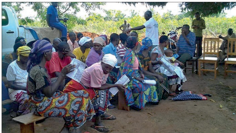
Members of the 28 families gather together to discuss Asha's case during the Turning the Tide mediation process.