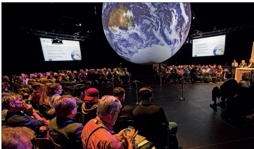
Delegates at COP23, the latest round of UN climate change talks in Bonn, Germany.

These are big goals, but ones that are necessary to meet the challenges we all face. In 2017 we