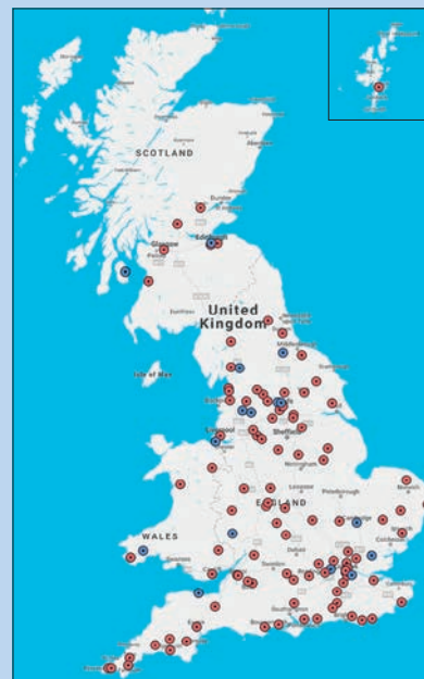
A map of all Quaker Week events known to Britain Yearly Meeting. Map: Google, BatchGeo