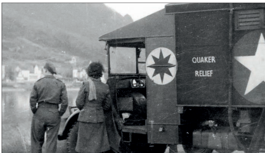
Quaker relief work was motivated by deep spiritual concern.

At the time of the award in 1947, Quakers in Britain, the USA and other countries were still heavily involved with relief work for one of the worst humanitarian crises of the twentieth century: the hundreds of thousands of 'displaced persons' created in the aftermath of World War II. Friends had been equally involved during the war itself. Their far-reaching humanitarian activities