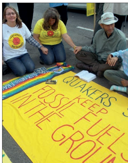
A demonstration against fracking at Preston New Road.

Contact: Maya Williams mayaw@quaker.org.uk 020 7663 1056