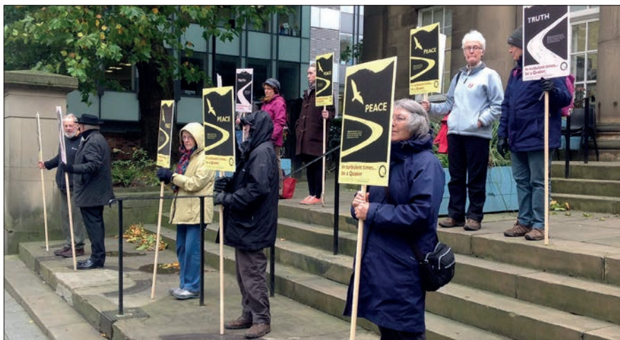
Manchester Quakers hold a vigil outside their meeting house, near the Conservative Party Conference, during Quaker Week 2017.

To sign up to our Outreach Cluster newsletter – where we'll be sharing our ideas for 2018 – or if you have any questions, email us at outreach@quaker.org.uk . We'll do our best to help your meeting have as vibrant and visible a presence as possible during the week.