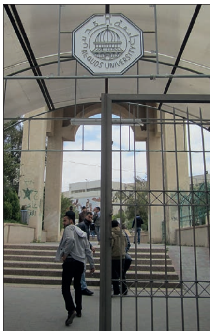
Students attending Al Quds University in East Jerusalem.

Through his family's work in setting up the education project, and now through the funding provided by the QPSW Relief Grant, his vision of a better future for at least a few Palestinians in the region is becoming a reality.