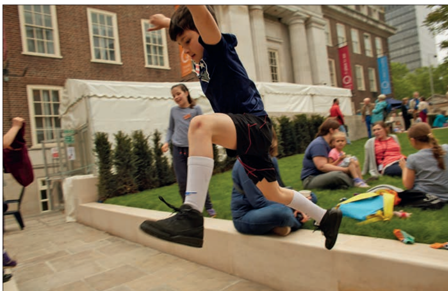
Children playing at Yearly Meeting 2016.