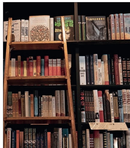
Look into Quakers in fiction on the blog.

To receive a monthly update of published blogs, plus other news, events and Quaker content, sign up to our monthly newsletter Quake! at www.quaker.org.uk/quake – you can unsubscribe at any time.