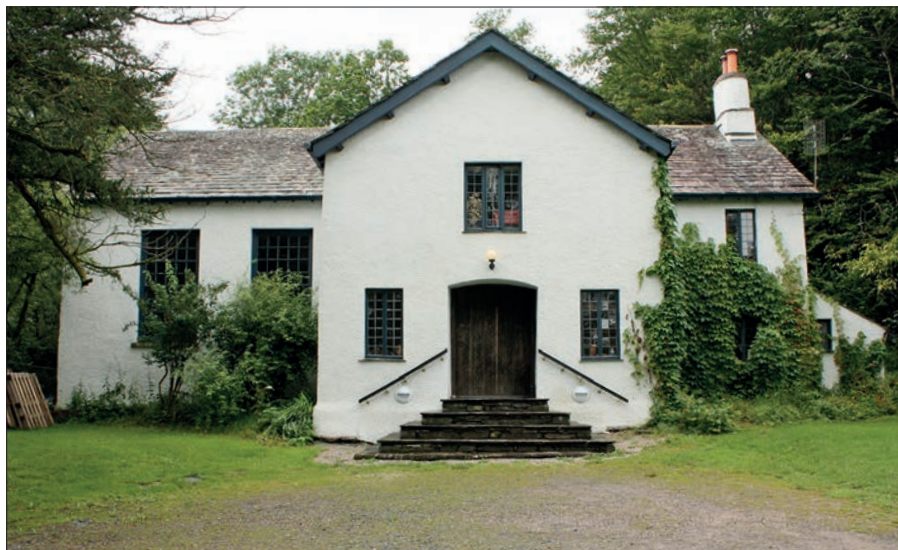
Rookhow Quaker Meeting House was built in 1725.

The three-year pilot, running until December 2019, has been funded by legacies to Britain Yearly Meeting, and is also supported by Woodbrooke's resources and facilities. The programme is being independently assessed, and options for its future are being considered by BYM and Woodbrooke Trustees in consultation with other groups including central committees and Meeting for Sufferings.