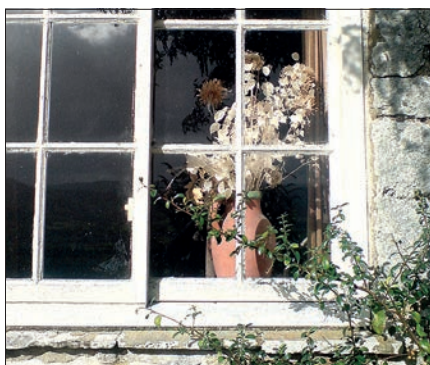
The Pales Meeting House.