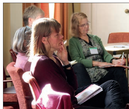
Advocates share their experiences.