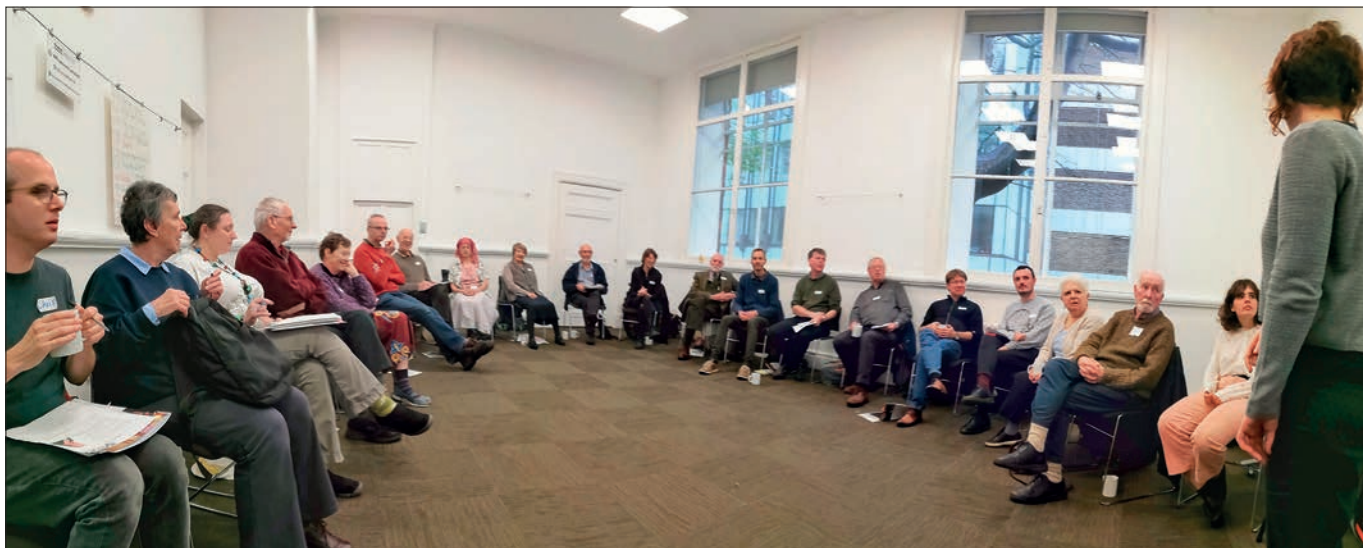
Quakers meet to explore ways of working with politicians on climate change.