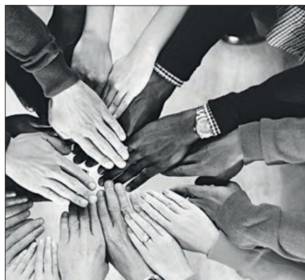
Working together to explore our diversity.

Please take part in the survey at http://bit.ly/qdsurvey18 or contact edwinap@quaker.org.uk if you require a paper copy. Find out more at http://bit.ly/diversityqblog .