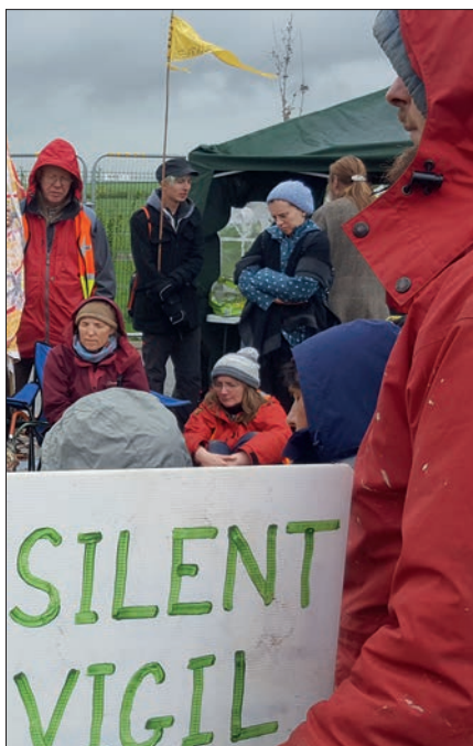
A silent protest as part of the No Faith in Fracking movement.

This has been true throughout our history, whether it's been working to end the slave trade, oppose war or support economic equality. While climate change will shape all our lives, it will mostly hit the world's poorest and least powerful people the hardest. Seen this way, it's a matter of justice.