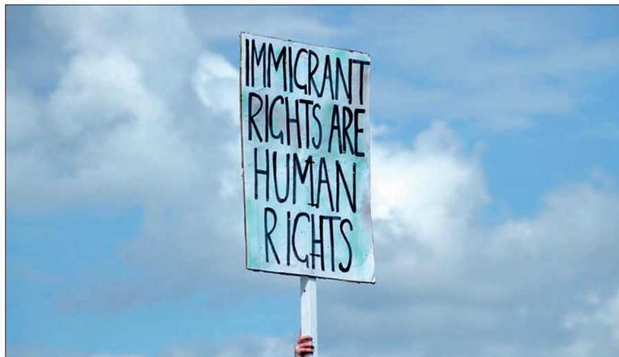
Quakers are supporting migrant rights with help from legacy funding.

If you are thinking about leaving a gift to any charity in your will, you want to know that it will make a difference. Would a gift to Britain Yearly Meeting (BYM) make a difference? Absolutely.