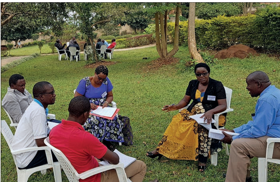
Participants at the first ever Turning the Tide East Africa Gathering.

Contact: Tobias Wellner tobiw@quaker.org.uk 020 7663 1075 www.quaker.org.uk/international-work