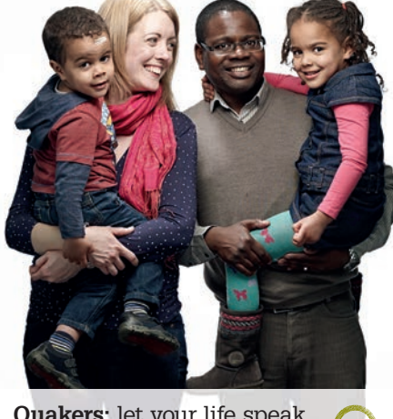
Quakers: let your life speak www.quaker.org.uk