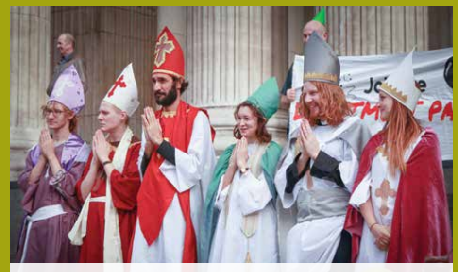
Activists throw a 'divestment party' on the steps of St Paul's Cathedral.

The Church's new investment policy, however, also outlines a commitment to shareholder engagement with other fossil fuel companies. With