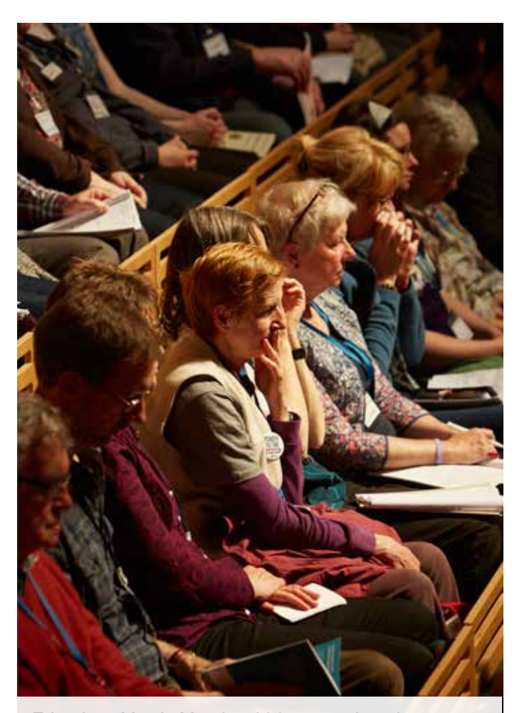
Friends at Yearly Meeting 2015 agreed a minute calling for equality.