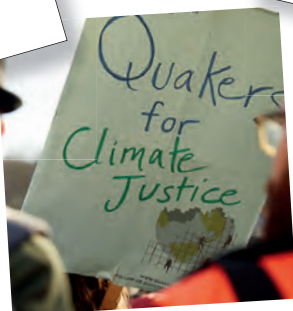
Campaigning for a more sustainable future