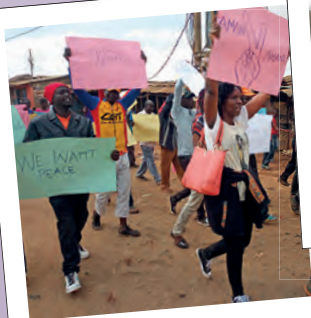
Supporting peacebuilders in East Africa