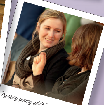
Engaging young adult Friends