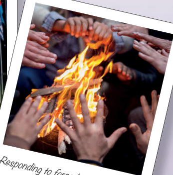
Responding to forced migration