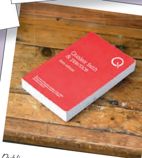
Publications and resources