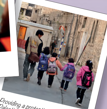
Providing a protective presence in Palestine and Israel