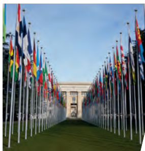
Working at the United Nations