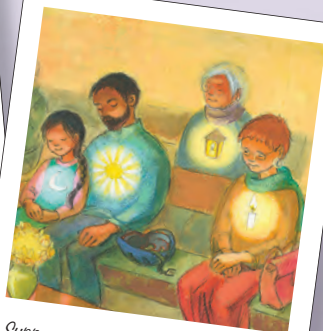
Supporting Quaker meetings