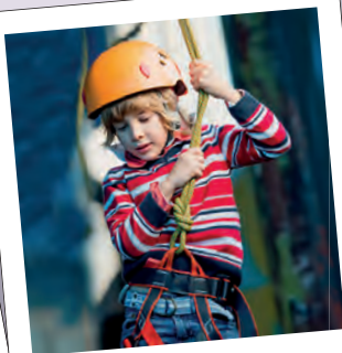
Working with children and young people