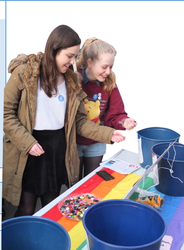
Young people voting for their vision of a safer world in 2015 | Photo, Ellis Brooks